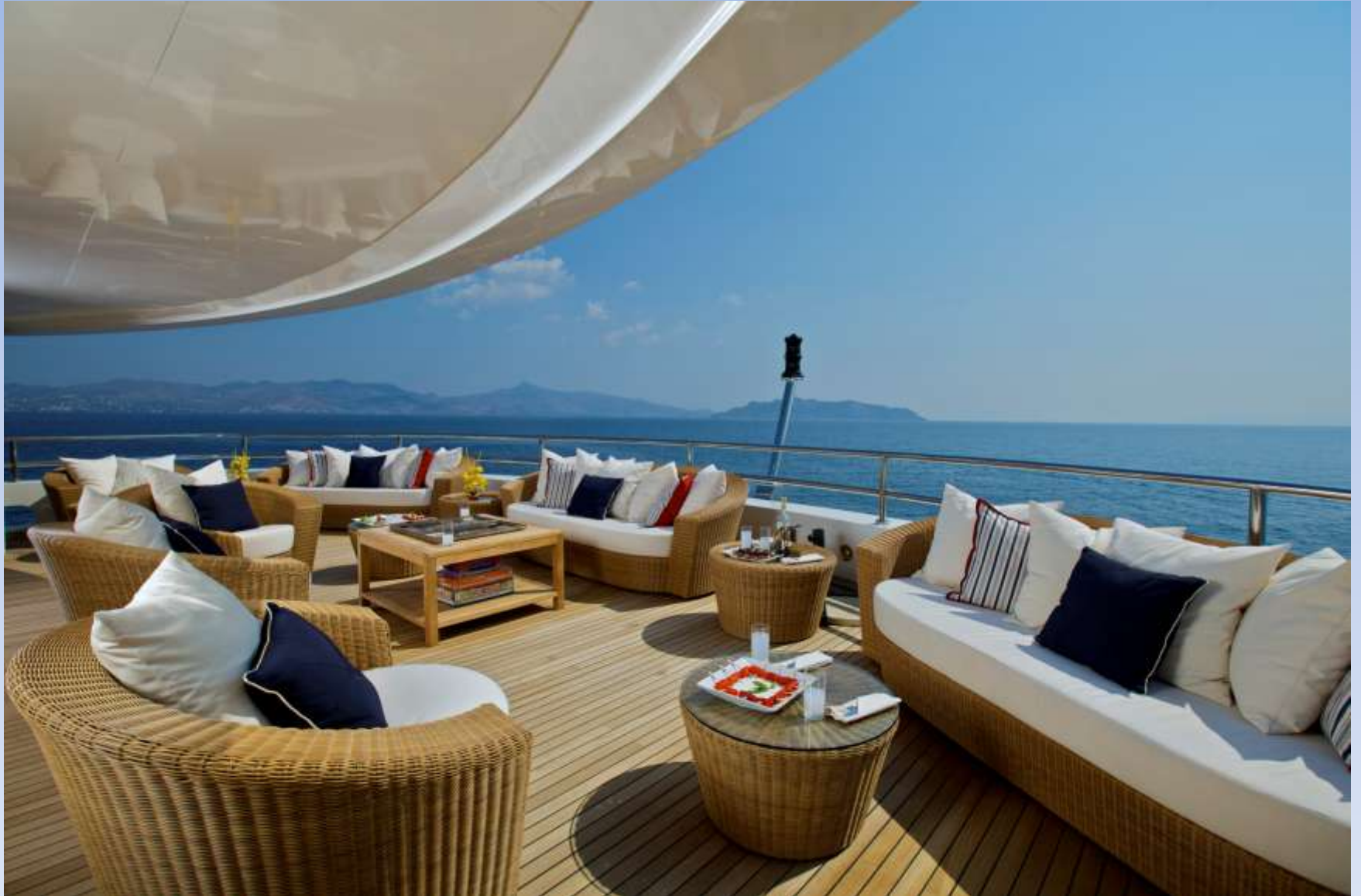
Upper Deck - Lounge