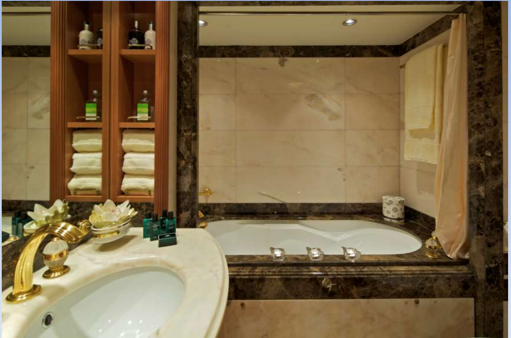
Guest Suite Bathroom