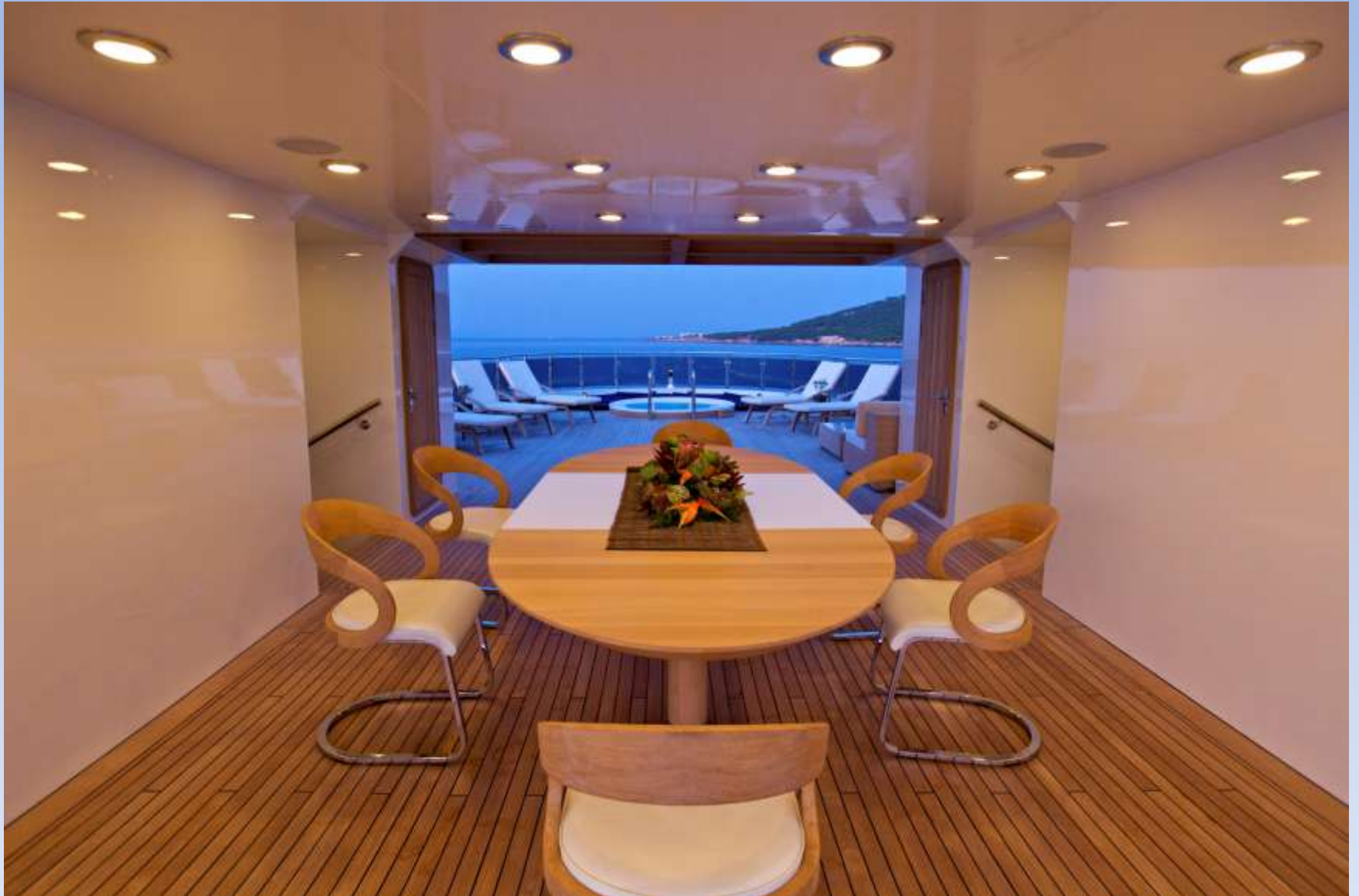
Sun Deck - Dinning