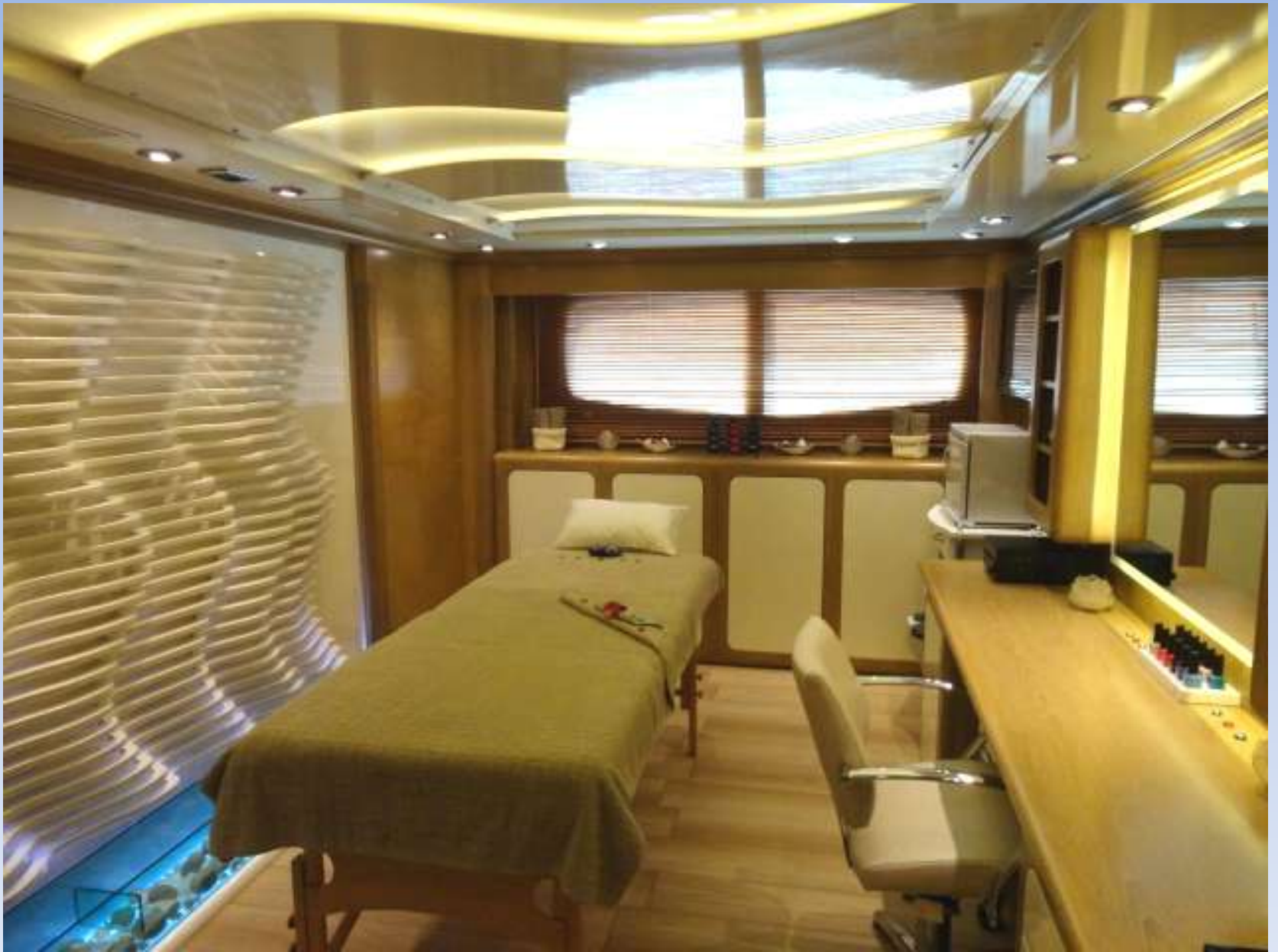
Massage Room / Beauty Salon