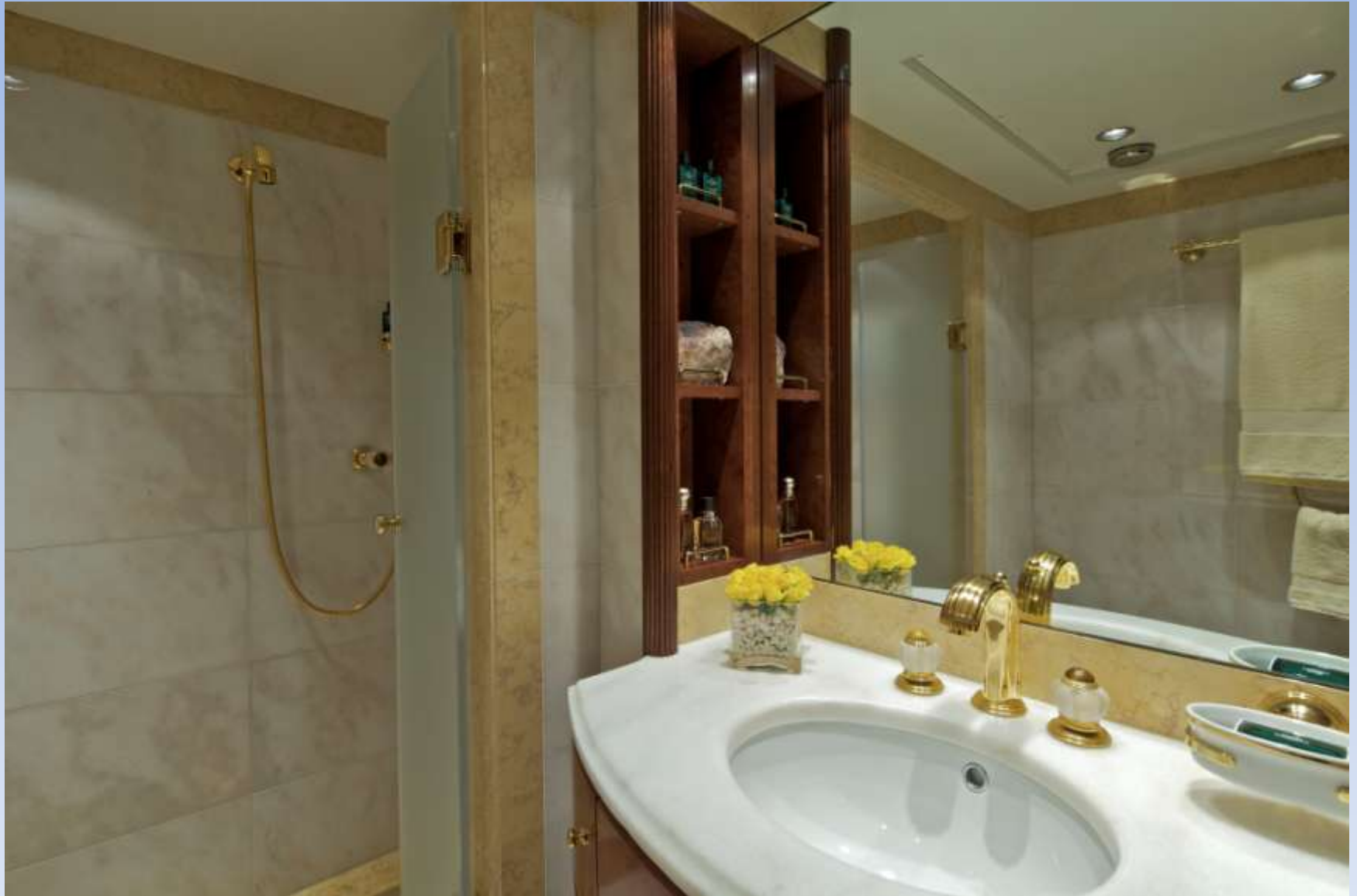
VIP Suite Bathroom