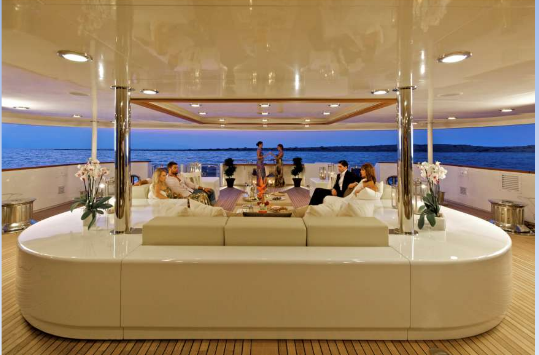
Main Deck - Lounge