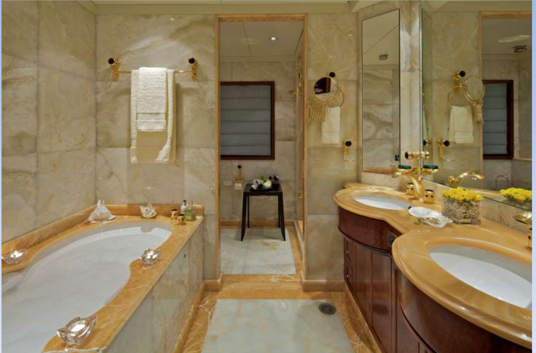
Master Suite Bathroom