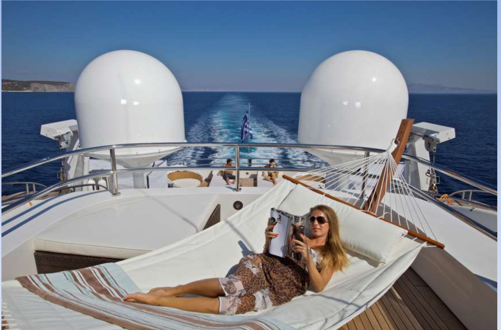
Sun Deck - Hammock