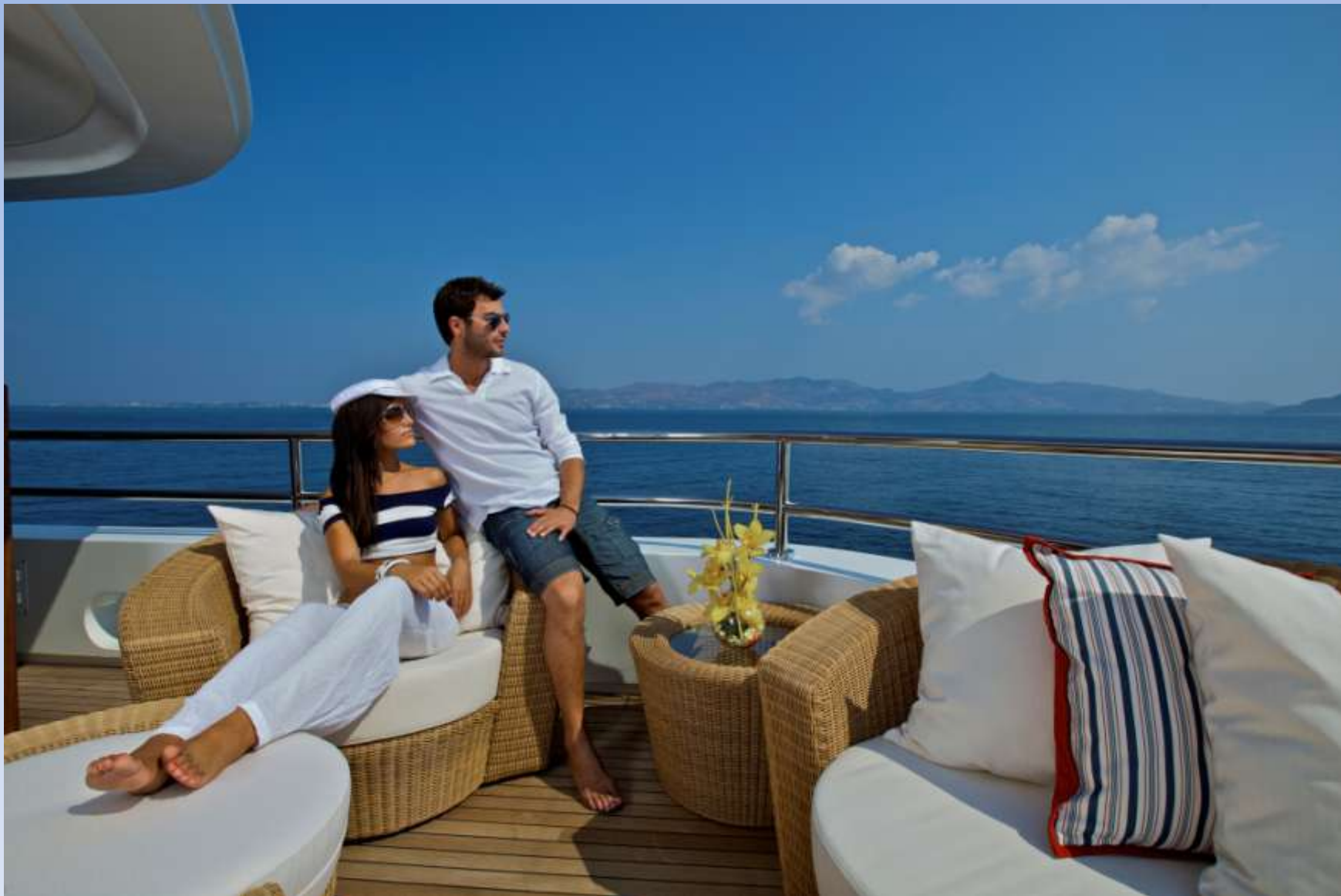
Upper Deck - Lounge