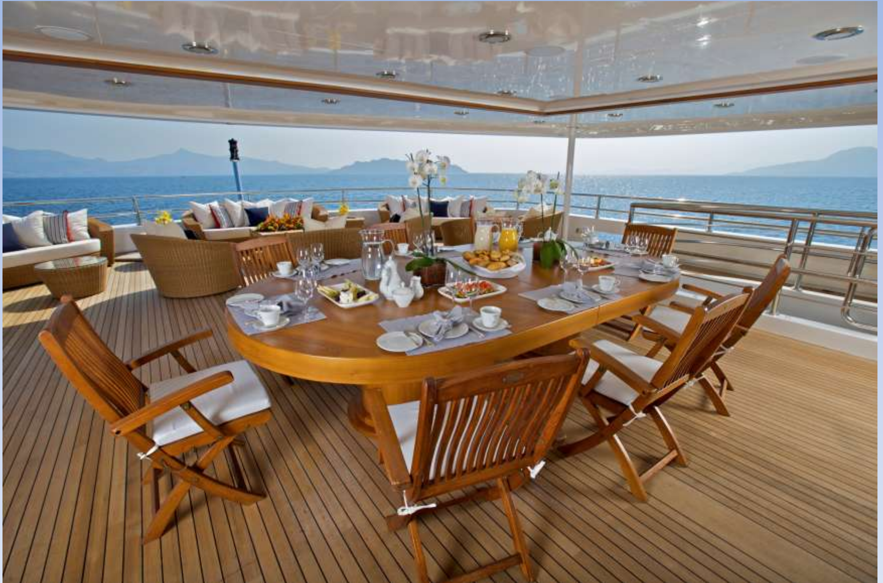
Upper Deck - Dining