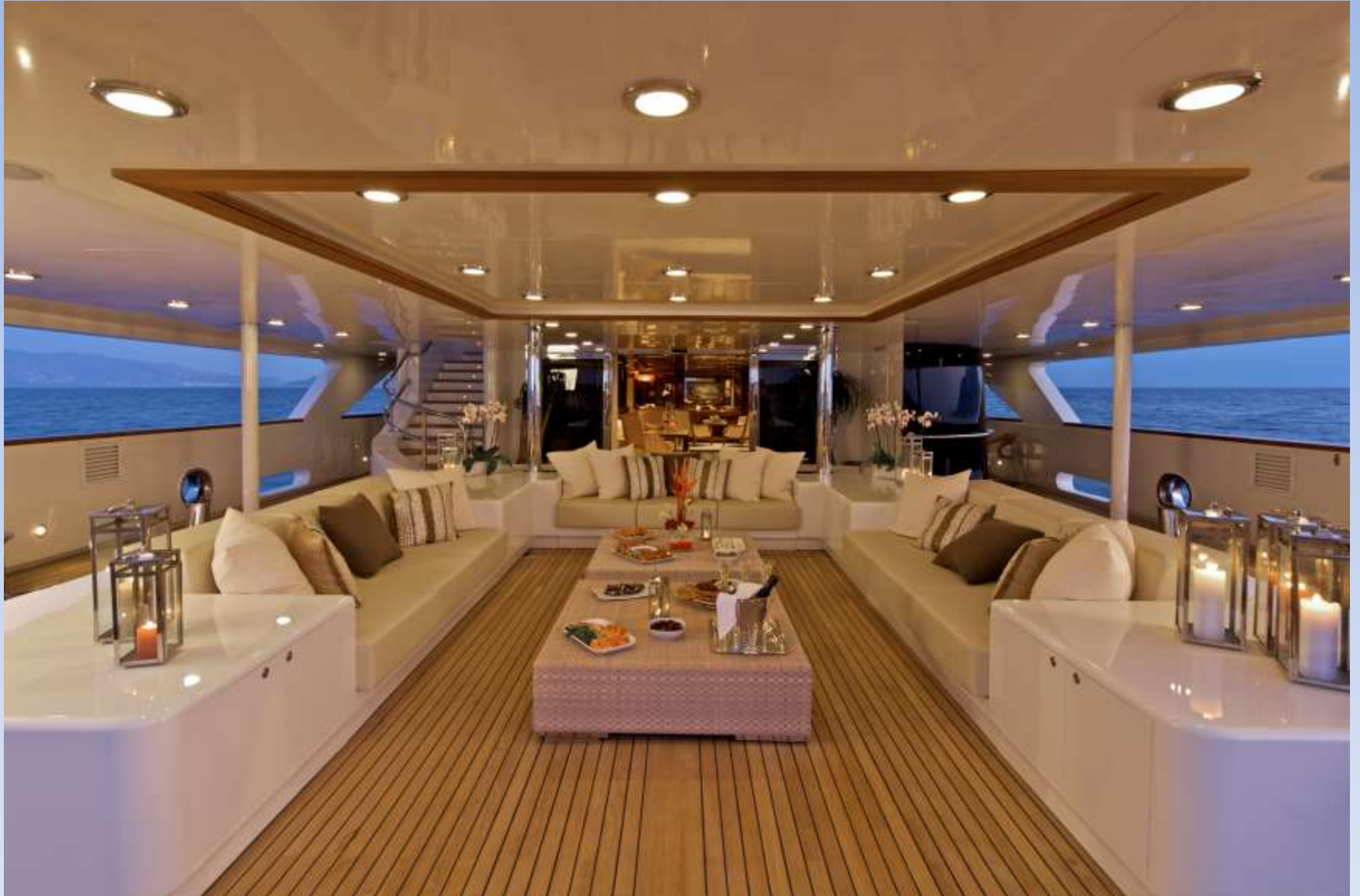
Main Deck - Lounge